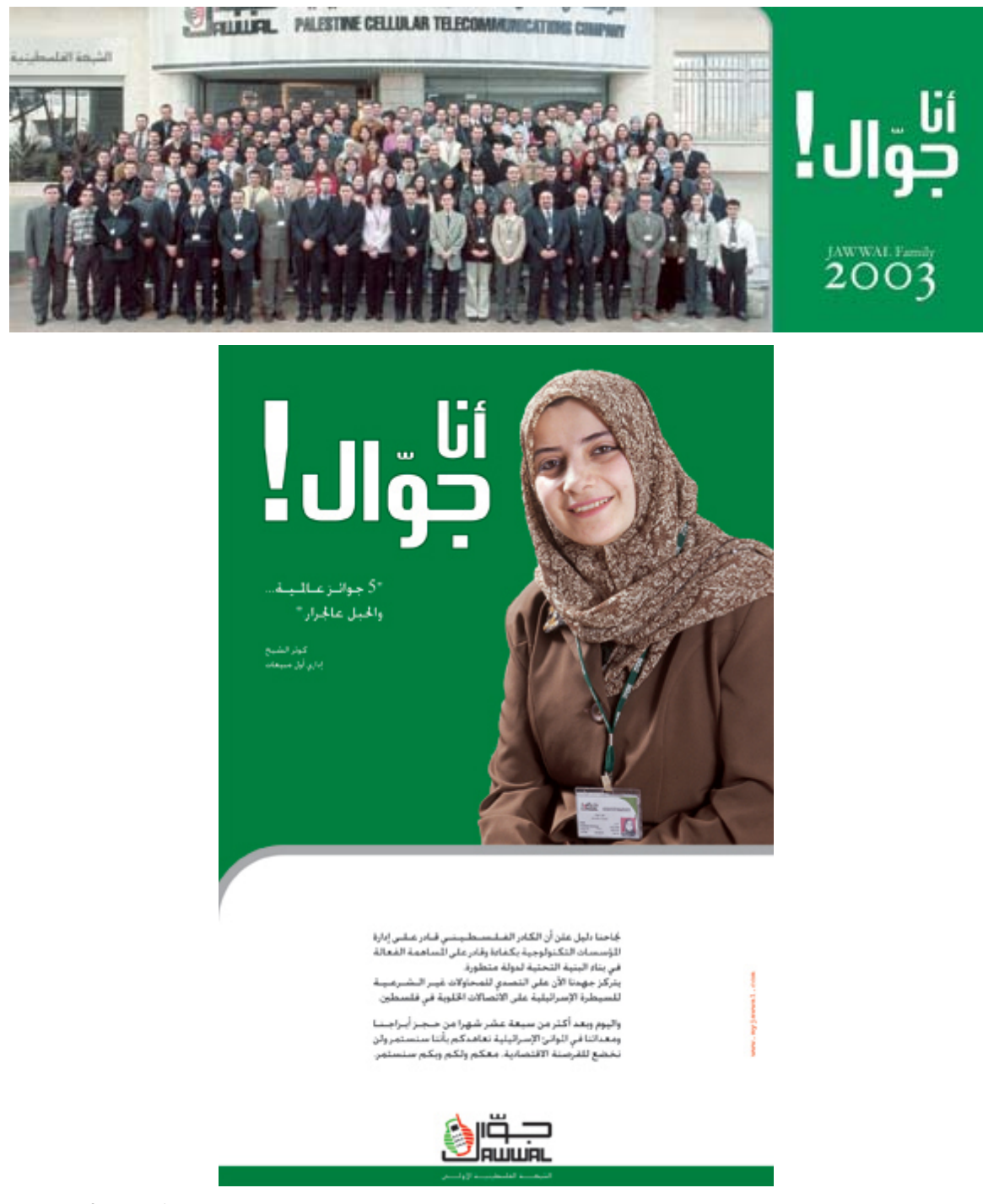
Figures 4 and 5: Portrayals of Jawwal staff in the advertisement campaign 'Ana Jawwal!' -I am Jawwal!