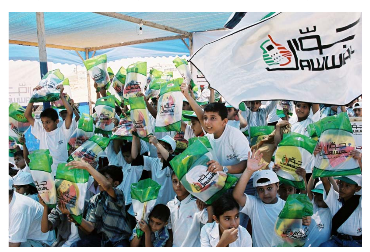
Figure 1: Children and free gifts at a Jawwal summer camp in Gaza. August 2005