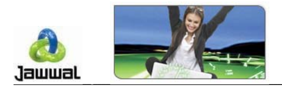
Figure 6: The new Jawwal logo and advertisement campaigns that have been released with it emphasise environmental responsibility and excellence in high-tech through abstract, soft designs and the choice of green and blue colors

Whatever the reasons, finding effective PR strategies for fighting local resistance has become very important. As the last phrase in the quote from Jawwal's website indicates, commitment to international environmental standards has been one of the main discourses through which the company has sought to deal with the crisis.<sup>33</sup> Thus in the spring 2006, at an occasion which coincided with the