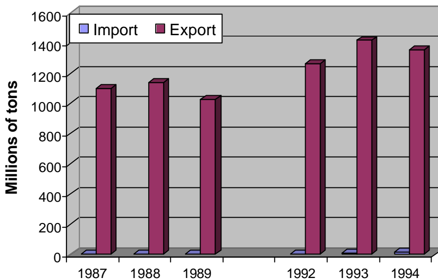
Figure 3: Import and Export of Oranges