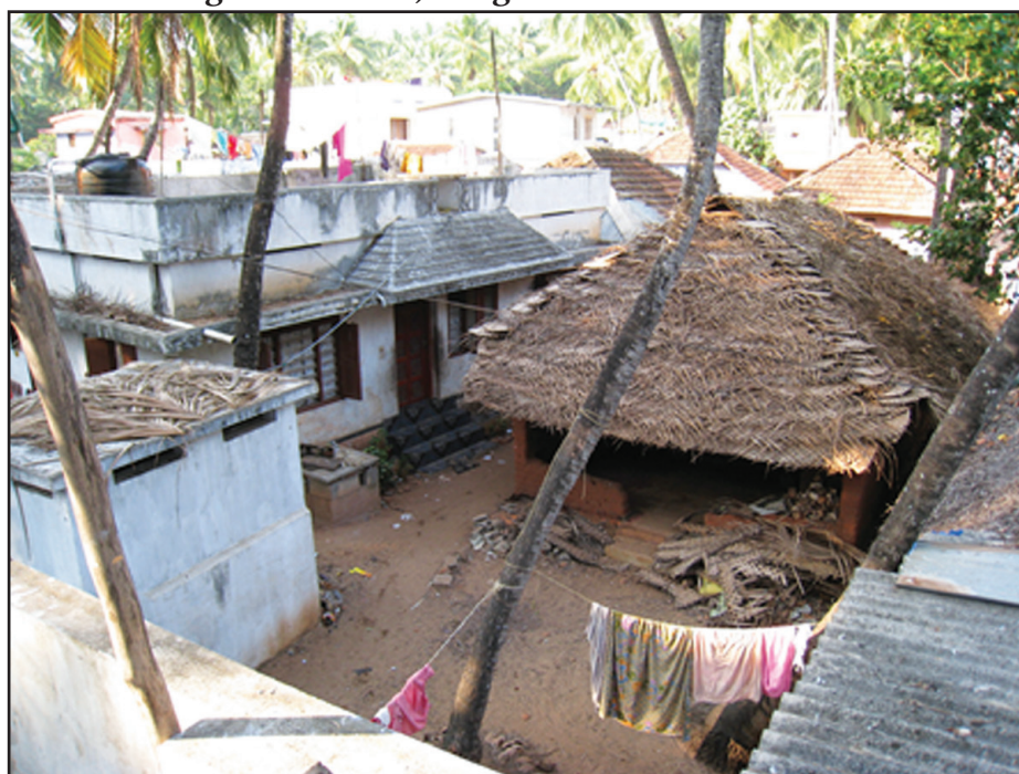
Figure 2: At left, a migrant's cement home in Kerala

The final sample was restricted to the 200 couples who participated in the follow-up survey. The average time the migrant spent working abroad was 11.8 years. Mean annual income in Qatar corresponded to 313,746 Indian rupees (INR) or $6,175 and average annual remittances touched INR133,967 ($2,637). The mean personal financial savings of the migrant held in Qatar and India corresponded to INR121,687 ($2,395). Financial savings is the sum of bank and postal account balances, cash in hand, life insurance and pension plan contributions, chitty fund (ROSCA), gold holdings, market value of stocks, and other forms of savings. The migrant also reported savings jointly held with his wife averaged at INR10,587 ($208). Approximately 37 per cent of the migrants reported that they were saving regularly. In India, the household's annual income (excluding members working abroad) averaged INR5,556 ($109). Mean years of schooling was higher for wives, at 11.7 years relative to 10.2 years for husbands. Wives reported an average of INR206,322 ($4,061) in financial savings. Joint savings held with the migrant, which was reported by the wife, averaged at INR6,910 ($136). About 47 per cent of wives stated that they saved regularly.