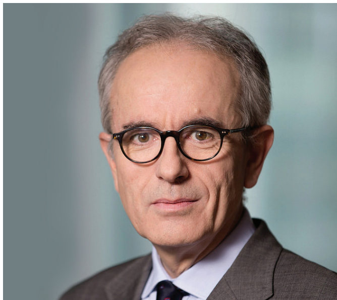
Figure 3: Ignazio Angeloni | European Central Bank

focused endeavour to remove barriers to cross-border trade. Yet, one participant argued that the CMU would end up sooner or later with a genuine and centralized CMU supervisor. Another delegate insisted that in the future the discussion would revolve around the mandate and scope for action of a 'prudential markets' supervisor and of its interaction with the banking supervisor. This will prove difficult as the two areas have different supervision logics: one focuses on actors (banks) while the other deals with activities (financial markets). On the other extreme of the spectrum, some participants questioned whether one would really need a European capital markets union in the first place. Diversifying the funding of Europe's economies could also be achieved within the realm of national markets.