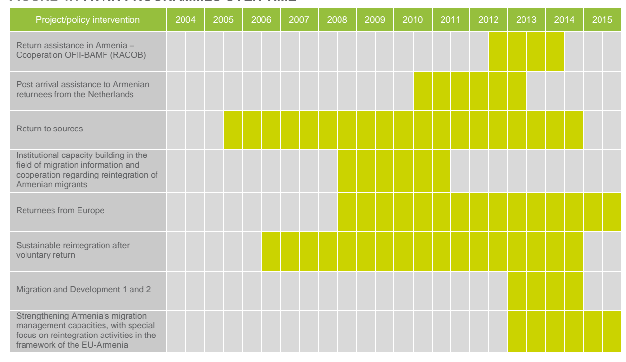
FIGURE 4.1 AVRR PROGRAMMES OVER TIME