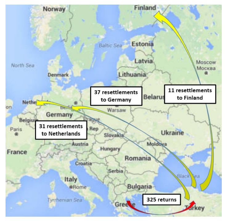
Figure 1 – Resettlements and returns under the EU-Turkey 1:1 Mechanism, 4/04 - 15/04, 2016