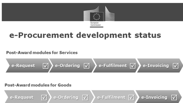
Figure 3. European Commission E-Procurement development status (Slide Player, 2014)

The latest results of the relevant research state that there is a direct relationship between the states' effectiveness against procurement corruption and the managerial tendency to expand the use of e-government. Towards this direction, decision makers should popularize electronic signatures, which is a prerequisite for secure e-procurement. Therefore, the funding offered by the European Union to implement this technology is being increased, monitoring almost all the way of procurement logistics and financial chains, as for example it is depicted in the flowchart below (Fig. 3). Furthermore, special bonuses or benefits could be awarded to private sector official or business operators using Information and Communication Technologies during their interaction with the governments. The increased traceability of transactions in the client-administration relationship results in reduced corruption as well as in enhanced productivity (Szopinski et al. 2017).