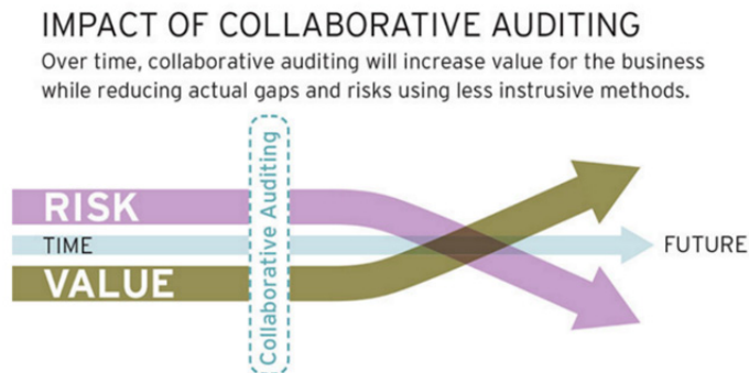
Figure 4. The added value of a collaborative and non-intrusive impact auditing, see (D’ Cunha 2013)

The interaction between procurement managers and Internal Audit Consultants in the methodological context described above results in remarkable organizational benefits. Procurement management may reasonably ensure a coherent and streamlined workflow which is characterized by the fact that the objectives described are concrete and achievable, risks are well considered and prioritized. In the meantime, the progress of the procurement objectives’ achievement is monitored, evaluated and updated with an approach following the so called SMART methodology, i.e. on the basis of specific, measurable, timely updated and relevant data (Diabay et al. 2016).