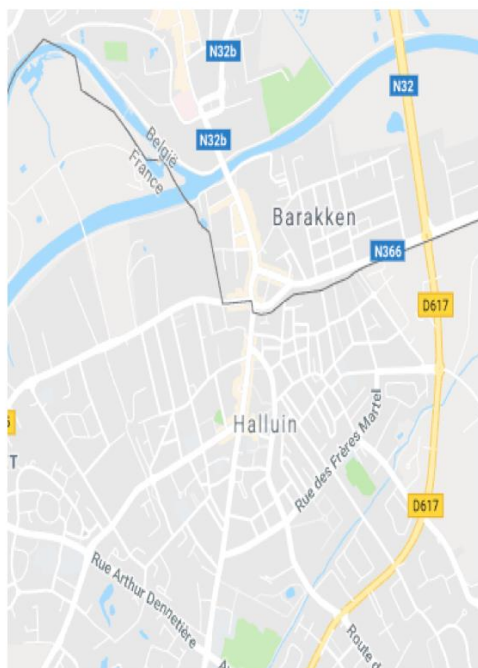
Exhibit 1. Halluin