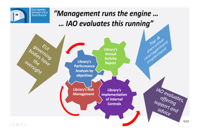
Figure 1: The mechanism supporting EUI Library's management

The core documents of the EUI management are the Five Year Strategic Plan and the Annual Activity Report. This last report is addressed by each administrative service to the EUI top management and the Internal Audit Office (see below, Figure 1), reflecting the executive management decisions and actions.