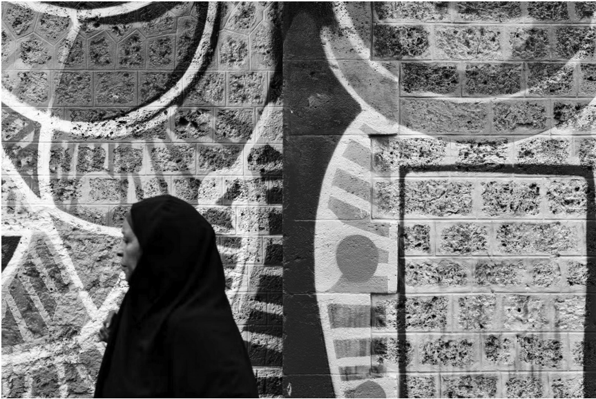
FIGURE 17.1 Woman wearing a veil.

Rights Centre (HRC). Conversely to the ECtHR, in 2018 the United Nations Human Rights Committee held that France’s prohibition on concealing one’s face violates the right to freedom of religion enshrined in Article 18 of the ICCPR. Moreover, it noted that the ban has a disproportionate impact on Muslim women, violating the right to non-discrimination. This is directly at odds with S.A.S. v. France . Adding to the mix of decisions by different institutions, on 15 July 2021, the Court of Justice of the European Union found that private companies and employers in the EU can ban people from wearing religious symbols, including headscarves, justified by the “employer’s desire to pursue a policy of political, philosophical and religious neutrality with regard to its customers or users, in order to take account of their legitimate wishes” ( WABE eV & MH Müller Handels GmbH v. MJ 2021).