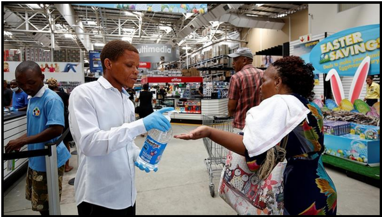
Most African countries have put in place restrictions to prevent the spread of the virus

Thus, the African Union supported the effective implementation of the principles of subsidiarity and complementarity should constitute the basis for the new humanitarian architecture. Thus, the role of international humanitarian organizations as well as regional organizations remains subsidiary to the intervention by local communities, which are the first responders to humanitarian crises and need to be supported.