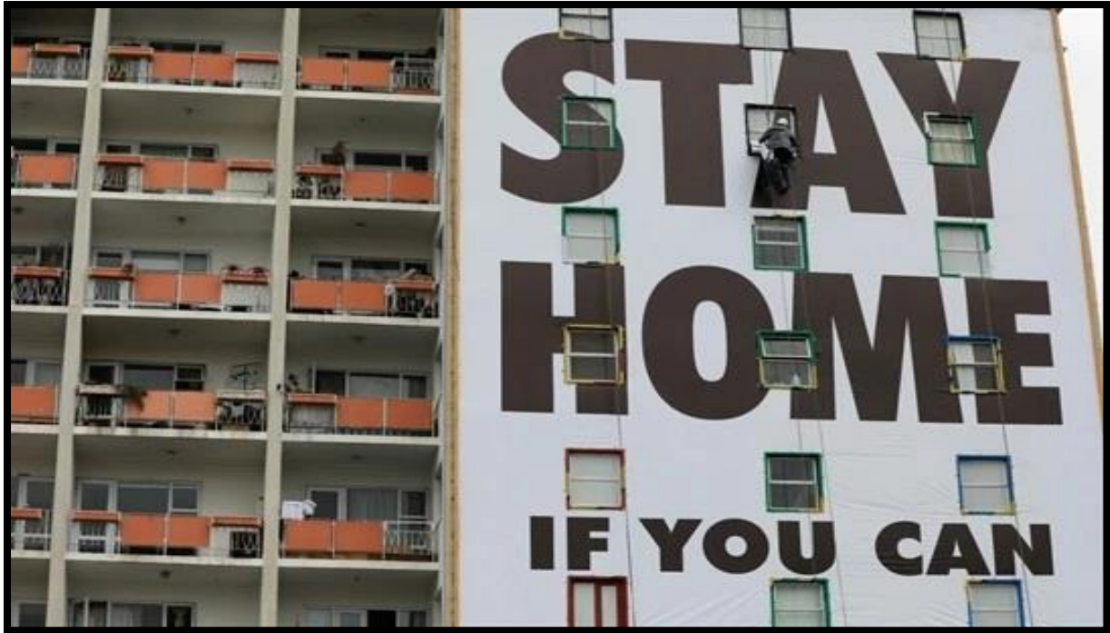
A billboard is installed on an apartment building in Cape Town, South Africa, March 25, 2020

To achieve this goal, the CAP aims at building the following four capabilities of the state. Predictive capabilities as the first line of defence against humanitarian crises related to early warning, which is a function of scientific and communication capacity. Preventive capabilities as the second line of defence against humanitarian crises related to the proactive developmental early intervention that is the function of socio-economic capacity, pro-poor policy, governance with foresight and the application of the principles of subsidiarity at national and regional level through decentralization, devolution or federation. The CAP focuses on prevention is a key factor to mitigate the impact of humanitarian crises and is highly intertwined with the primary duty of the state.