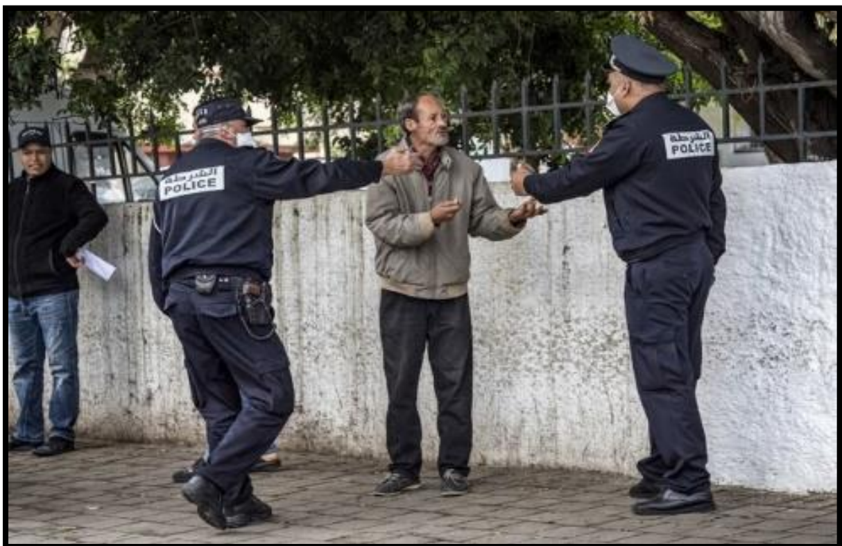
Policemen instruct a man to return home in Morocco’s capital Rabat on March 22 2020

Building effective and sustainable humanitarian architecture is unthinkable without the active participation of national and local authorities and local communities. A more revolutionary approach of CAP relates to the reconceptualization of the ultimate aims of the humanitarian aid. CAP emphasis on institutional mechanisms need to be established at national and local level. As part of the implementation of the principle of subsidiarity, all actors at international, regional and sub-regional levels should support the national efforts, and the national authorities should serve as backups to local authorities and communities.