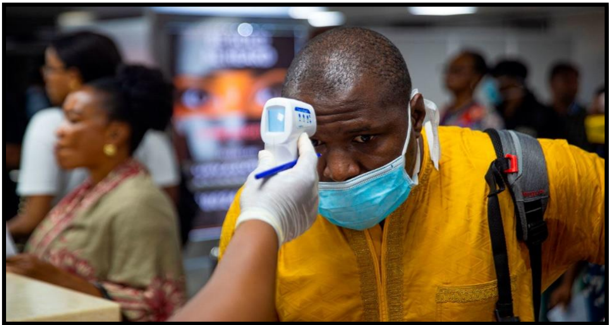
Cover A passenger's temperature is taken on arrival at Murtala Muhammed International Airport in Nigeria February 27

the contributions of host governments and communities to humanitarian situations.