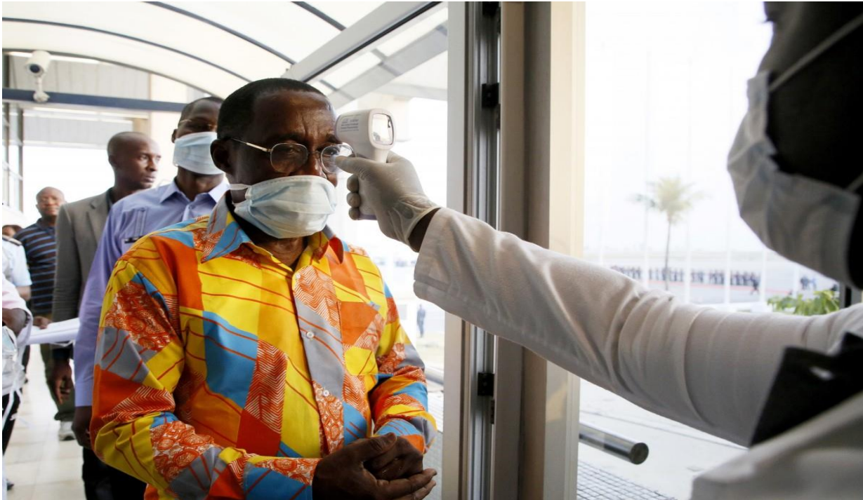
An Ivorian health worker checks the temperature of Ivorian Minister of Health and Public Hygiene Eugene Aka Aoule at Felix Houphouet-Boigny Airport in Abidjan

The spread of Coronavirus, COVID-19, has now hit almost all African countries with over 10,000 confirmed cases in all African countries. (1) According to the latest data by the Africa Center for Disease Control, the breakdown remains fluid as countries confirm cases as and when. The 1.2 billion-people continent of Africa has rising cases with a handful of countries holding out. Nigeria was the first sub-Saharan country to report a COVID-19 case February 27. By April 2 of Africa's 54 countries, only four have yet to report a case of the virus: Comoros, Lesotho, Sao Tome and Principe and South Sudan. The global coronavirus pandemic has hit Africa and the resultant health crisis may easily turn into humanitarian and security disasters. These will worsen persistent crises caused by climate change-induced drought, terrorism and violent extremism, and epidemics like the Ebola disease.