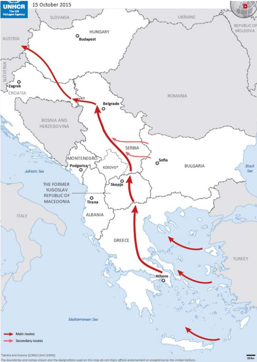
Figure 3: The Balkan route via Hungary