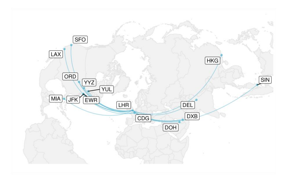
Figure 2: Map of Extra-EU Routes