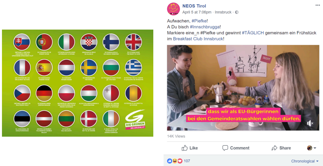
Illustration 1: Flyer and online video campaign, The Greens (left) and NEOS (right), municipal and mayoral elections in Innsbruck 2018