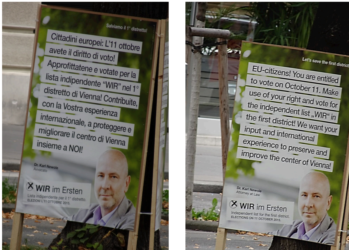
Illustration 2: Campaign posters "WIR im Ersten", Vienna district council elections 2015

District Council; one of the two members from 2010 to 2015 was a French citizen. 90 In 2015, the party ran a poster campaign in German, French, Italian and English (Illustration 2).