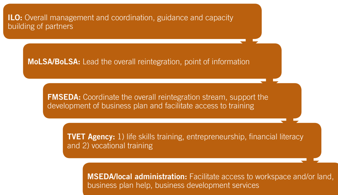
Figure 4. Actors directly providing services to returnees in support of economic reintegration