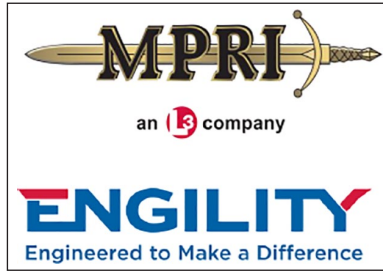
Figure 4. From MPRI to Engility.