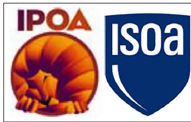
Figure 6. From IPOA to ISOA.

doing so, the ISOA also changed its logo. The original representamen – the sleeping red lion shown in Figure 6 – had been envisaged by the first director of the association, who had identified peace-keeping and security sector reform as primary markets for PMSCs. Accordingly, he opted for a trope vaguely evoking sub-Saharan Africa as its interpretant (Interview 7). The new logo shown in figure 6, a simple blue shield containing a white logotype, better reflects the more global outlook of its members and has an indexical connection to the provision of defensive protective services.