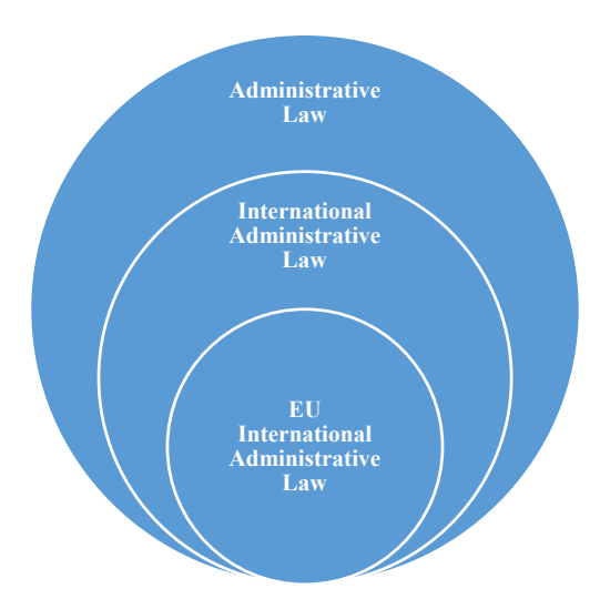
Figure 2. Mutual relations between administrative law, international administrative law and the EU international administrative law

From the viewpoint of the Member States, the delimiting norms arising from either directives or regulations represent an integral part of their domestic administrative law. This viewpoint, outlined in the figure above, does follow the very traditional approach to international administrative law as a national project of a sovereign state. Under this approach, we can barely speak about any regional, or universal international administrative law, but there are numerous frameworks existing in each of the different states.<sup>101</sup> While