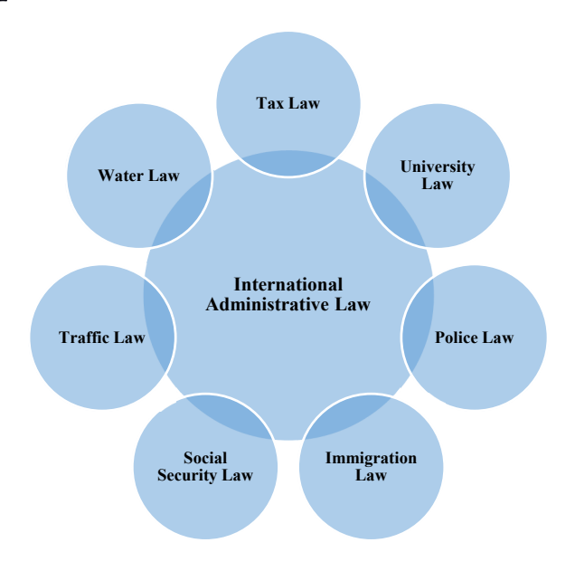
Figure 1. Mutual relations between international administrative law and substantive parts of domestic administrative law

Neumeyer, was understood as an integral part of administrative law, rather than international public law. However, instead of constituting a coherent branch of substantive law, international administrative law is comprised of a set of delimiting norms, which are provided among the substantive law (such as tax law, social security law, university law, traffic law, police law, immigration law, natural resources law, confessional law etc.). In this regard, Neumeyer argued that a delimiting norm can provide for legal effects of foreign administrative measures by limiting the application of domestic administrative law in certain cases where a foreign element is present. So, for example, statutory laws governing traffic may provide for legal consequences of a foreign driving licence, statutory laws governing university education can provide for legal consequences of a diploma issued by a foreign university and so on.