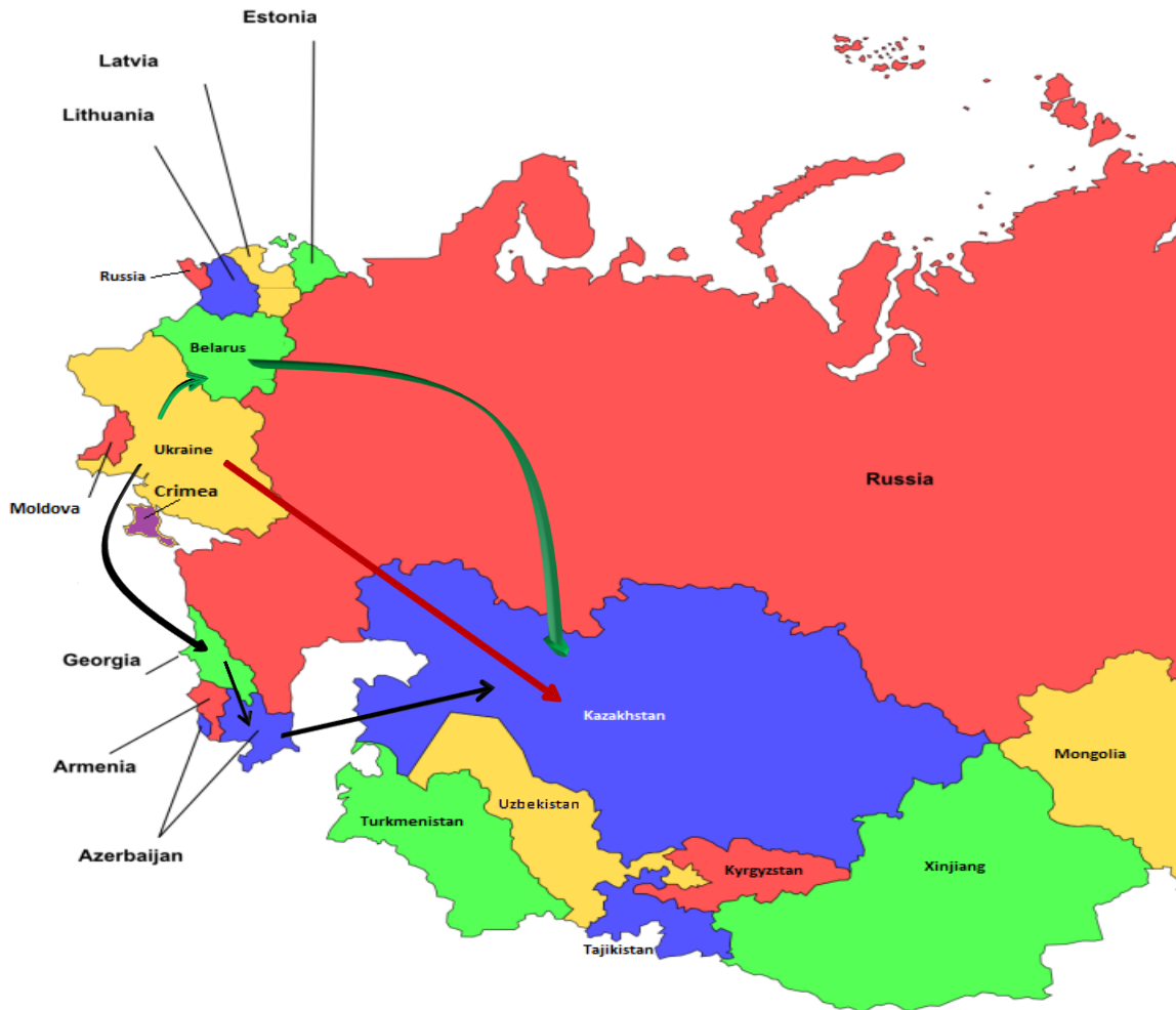
Figure 1 – Transit routes from Ukraine to Kazakhstan