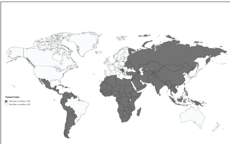
Figure 1 Yussef Al Tamimi on the basis of Passport Index (2017/2021)

This inequality is evident from a visualization of the Passport Index (Figure 1 below), showing in white the nationalities which need an entry visa for less than 100 countries, and in black those needing a visa for more than 100 countries (Spijkerboer, 2018). The introduction of carrier sanctions means that visa requirements are enforced within the black countries on the map.