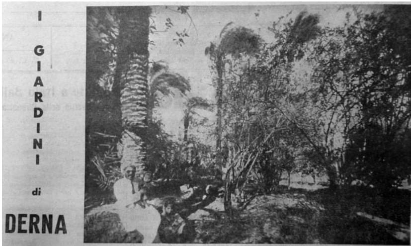
Figure 2. ‘Derna’s gardens’ in L’Azione Coloniale , 3 August 1933. Courtesy of the Ministry of Cultural Heritage and Activities and Tourism (MiBAC). National Central Library of Florence. No reproduction permitted.

seemed tamed. Agricultural reclamation established a village of 18 families in El Azizia, approximately 40 kilometres south-west of Tripoli, an area notable for its extremely high temperatures and prolonged droughts (El Fadli et al. 2013; Court 1949), and it was an exemplary demonstration in favour of the Fascist rural colonisation scheme ( L’Italia Coloniale 1936d , 151). More relevant was Libyan governor Italo Balbo’s proclamation that ‘the eternal problem of water’ had been definitively sorted out by the mid-1930s, following the launch of a programme of extensive drilling that had no equivalent in either Europe or Africa. Technicians sank boreholes reaching as deep as 400 metres, achieving the ‘miracle’ of a water supply (Ornato 1938b, 123–4). A successful resolution to sandy desert winds was about to come, thanks to the growth of tree and root barriers (Cristaldi 1938, 111–12). In 1932 the development of Cyrenaica started and followed the same pattern. Former sandy and stony military camps on the plain surrounding Al-Marj, and in earlier times Barce, were fertilised for agriculture, based on scientific and rational criteria. From 1933, the land yielded increased crop products, wheat in particular, and the progressive transformation of the soil allowed for the cultivation of fruit and olive trees, cotton, castor-oil plants, flax and vegetables (De Bernardinis 1939, 12–13).