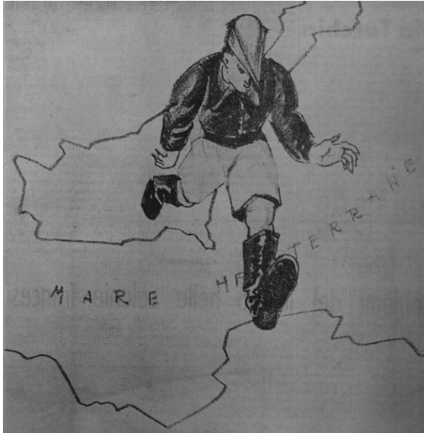
Figure 1. 'The Mediterranean: the centre of the Roman civilization'. Illustration by C. Celano in L'Azione Coloniale , 15 March 1934. Courtesy of the Ministry of Cultural Heritage and Activities and Tourism (MiBAC). National Central Library of Florence. No reproduction permitted.

of Fascist colonial environments. To merge those two lines of enquiry, this paper adopts and adjusts questions and approaches outlined by Marco Armiero and Richard Tucker (2017, 7–10) in their edited volume, Environmental History of Modern Migrations . In the following sections, migrants appear not only as 'pioneers taming the frontiers' but also as settlers with 'stories of exploitation, of competition with other ethnic groups over access and control of natural resources, of failure in adapting to new socioecologies' (Armiero and Tucker 2017, 8). Although a migration framework can hardly integrate colonial mobility patterns, primary sources and existing scholarship label the intensive Fascist demographic project in North Africa as a case study of either Italian migration (Labanca 2002a) or Italian mobility (Ben-Ghiat and Hom 2016; Ben-Ghiat 2015, 78–117). Such sources and studies make this paper appropriate for publication here (Figure 1).