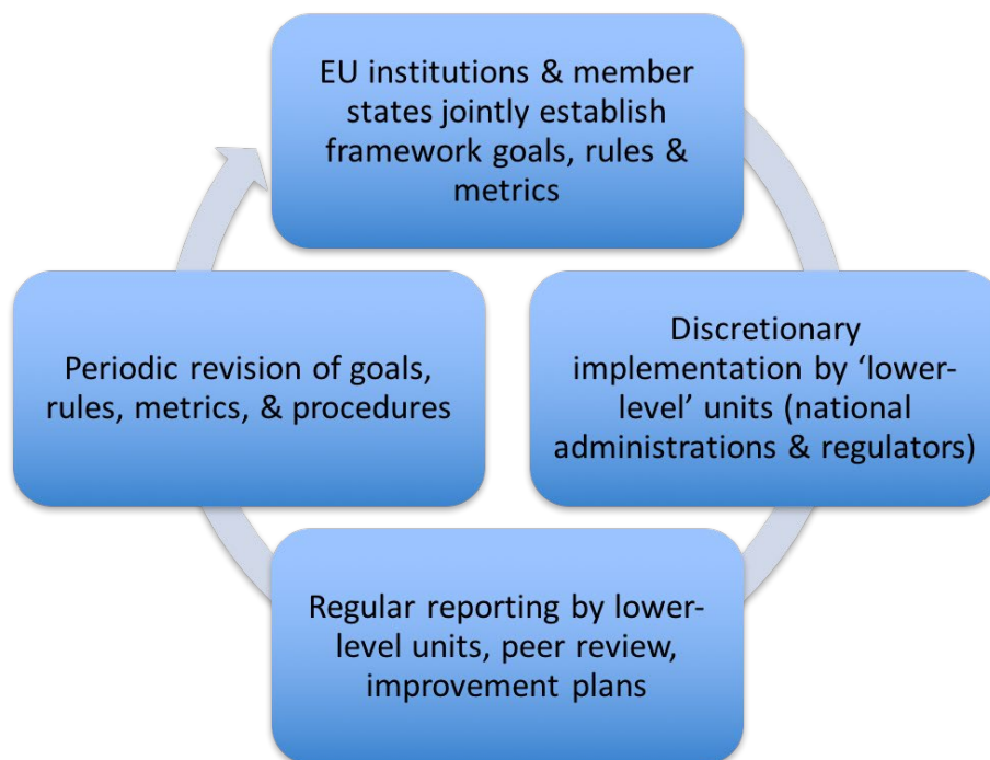
Figure 1: EU XG as an iterative, multi-level architecture