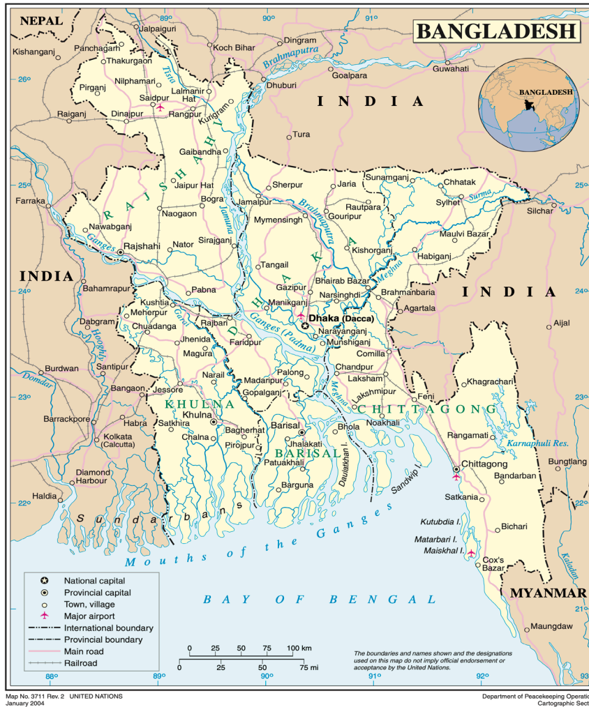
Figure 1. Map of Bangladesh

The map might reproduce territorial boundaries that are contested by multiple actors. No endorsement is intended.