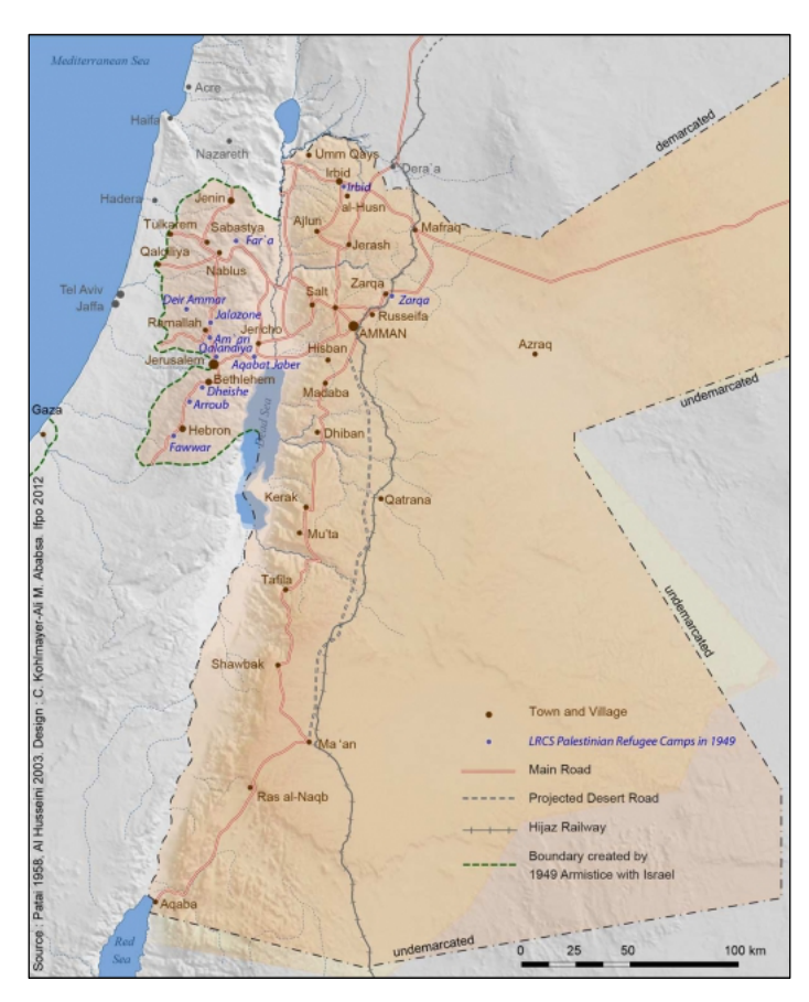
Figure 2: Map of the East and West Banks<sup>29</sup>

In addition, the Transjordanian government quickly took steps to include Palestinians in the national community. In February 1949 (a month before the war's end), the government issued a supplemental law, or "addendum (الذيك)", to the passports law that granted Palestinians access to Transjordanian passports. Article 2 of this supplemental law stated: "No matter what is stated in the second article of the Passports Law No. 5 of 1942, any Arab Palestinian person holding a Palestinian nationality may procure a Transjordanian passport in accordance with the Passports Law No. 5 of 1942". In addition, Article 3 specified that "The provisions of the aforementioned passport law and the bylaws, regulations, and orders issued according to it shall be applied to persons who obtain passports in accordance with this addendum". In the provision of the applied to persons who obtain passports in accordance with this addendum". In the provision of the applied to persons who obtain passports in accordance with this addendum.