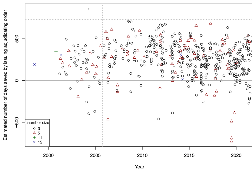
Figure 2: The Time Efficiency Gains of Adjudicating Orders Compared to Judgments [Colour figure can be viewed at wileyonlinelibrary.com ]

Note: The procedure time of adjudicating orders compared to the procedure time of the judgments they cite (number of days). Each data point represents an order. A value of 100 on the Y axis indicates that the procedure time of the given order was 100 days shorter than the average procedure time of the judgments it cited. In case of negative values, the Court spent more time issuing the adjudicating orders than it spent on the judgments it was citing. Symbols indicate chamber size. Vertical lines indicate changes in the RoP, horizontal lines mark time in years.