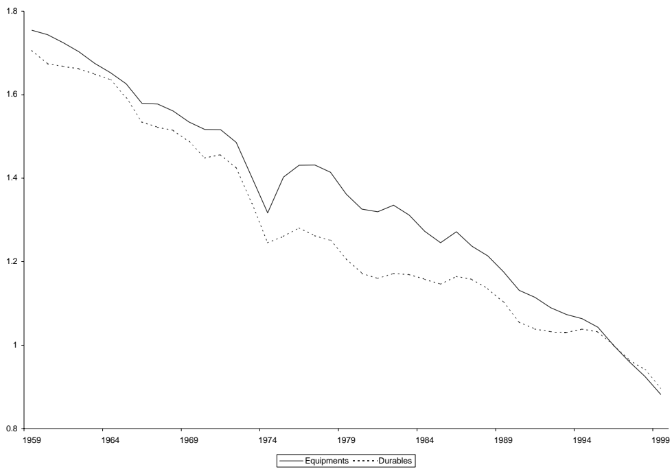
Figure 1: Equipment investment and durable consumption prices relative to non-durable consumption prices.